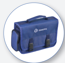
SA 47M Carrying Bag Fabric Material