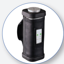
SV 110 Hand-Arm Vibration Calibrator