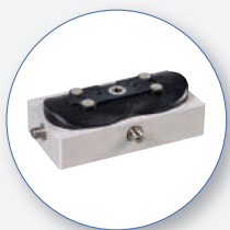
SA 105 Calibration Adapter to SV107