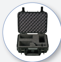
SA 76 Waterproof Carrying Case