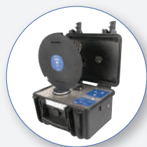
SV 111 Hand-Arm and Whole-Body Vibration Calibrator