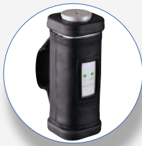
SV 110 Hand-Arm Vibration Calibrator