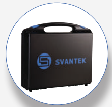
SA 146 Carrying Case for SV 106A and accessories