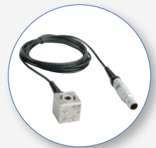
SV 151 Tri-Axial SEAT Vibration Accelerometer