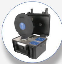
SV 111 Hand-Arm and Whole-Body Vibration Calibrator