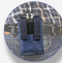
SA 89 Belt Bag for SV 106A