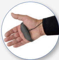
SV 105 Tri-Axial Hand-Arm Vibration Accelerometer

MEMS accelerometers which have many advantages including shock resistance, no DC-shift effect, very low power and frequency response down to DC.