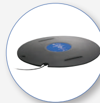
SV 38V Whole-Body Vibration Accelerometer