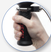
SV 150 Tri-Axial Hand-Arm Vibration Accelerometer