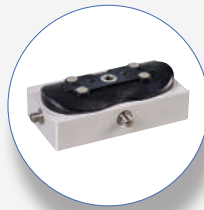
SA 105 Calibration Adapter to SV105 and SV105F