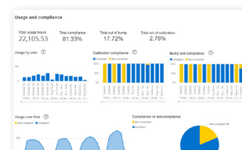
Blackline Analytics reporting platform