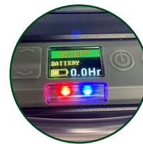
OLED full colour display with Red/ Blue LED's to indicate pump status, visible from a distance