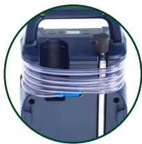
Mast and sampling tube are fitted to the pump, during use and transportation