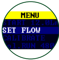
Intuitive menu navigation