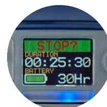
Colour coded display showing remaining battery life