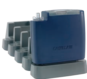
Apex2 pump with 5 way charger