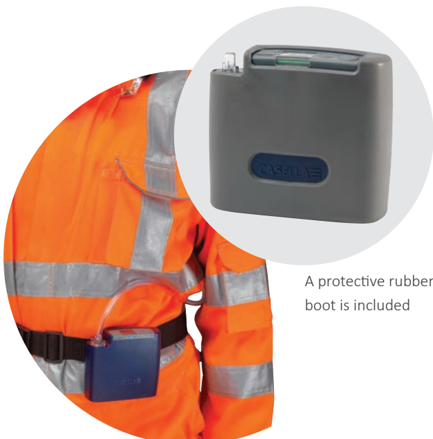
A protective rubber boot is included