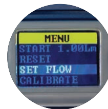
Easy to use menu