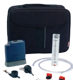
Starter Kit available to include sampling accessories